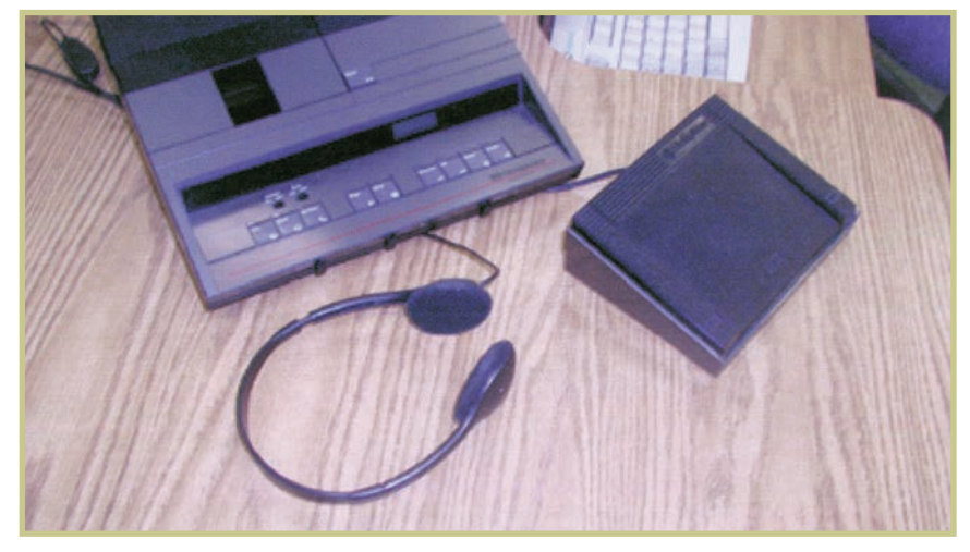
FIGURE 4—Desktop Transcription System with Foot Pedal

Transcriptionists serve as an important link between the clinical side of medicine and the information side of medicine. Transcriptionists must be able to understand and accurately transcribe the medical information in a clear and understandable format. Good transcriptionists will spot mistakes or inconsistencies in medical reports and discuss them with the clinicians. This allows the person who dictated the information to update or correct the report. Because these reports are filed in the patient's record and used for future treatment, it's important that the information be accurate. The transcriptionist's ability to understand and correctly transcribe the information reduces the chance of patients receiving incorrect or harmful treatment in the future.